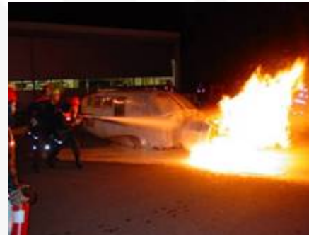
Ausbildung vo Regionalflygplätzen