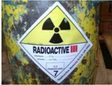
aktive Er anze Kan