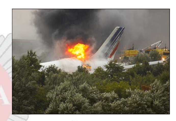
BECAUSE AN AIR CRASH CAN OCCUR ANYTIME AND ANYWHERE!